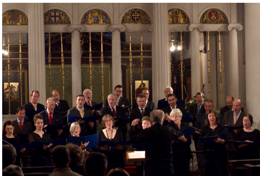
CC21 performing at Grosvenor Chapel (photo: Ray Soper, Nov 08)